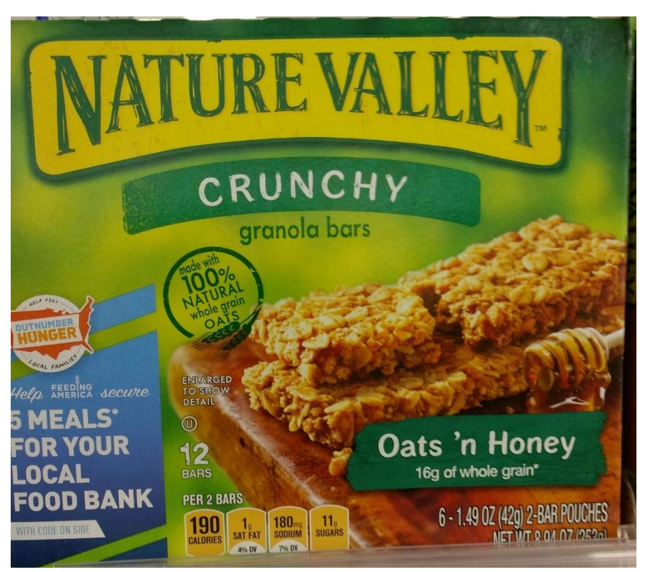
Fig. 1, Nature Valley Crunchy Granola Bars Packaging

8. To capture this growing market, General Mills labels Nature Valley as "Made with 100% Natural Whole Grain Oats."