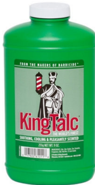
15 Accused Products

27 15. The Accused Products infringe the Clubman Trade Dress. Defendants’ 28 product packaging prominently features a black and white drawing of a man holding a