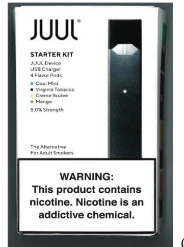
(Spring, 2018 to present)

exceptionally potent dose of nicotine, that JUUL is delivering doses of nicotine that are several times higher than those allowed in normal cigarettes, that the efficiency with which the product delivers nicotine into the bloodstream increases its addictiveness, that it can be more addictive than traditional cigarettes and that it poses serious health risks.