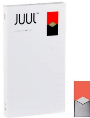
Original JUUL Design