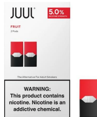
Recent JUUL Design