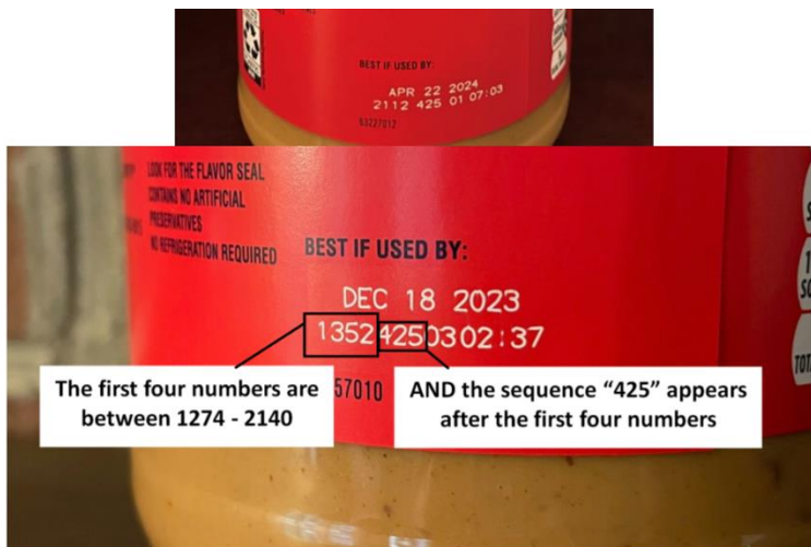
Case Count Map Provided by CDC

https://www.fda.gov/food/outbreaks-foodborne-illness/outbreak-investigation-salmonella-peanut-butter-may-2022