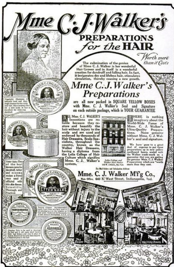
Mention THE CASES.